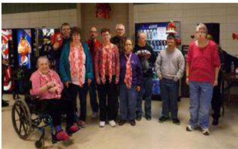
WESCO'S Valentine's Day Court